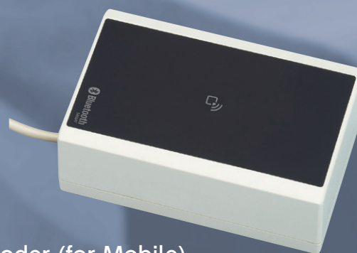
BLE encoder (for Mobile) W105mm×H65mm×D40.2mm