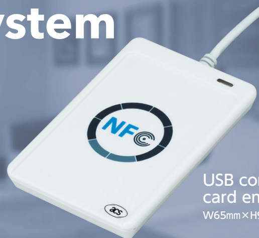
USB connected card encoder W65mm×H98mm×D12.8mm