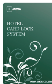
Mifare 1K (1kbyte)