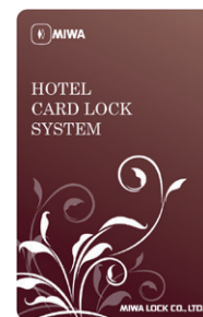
Mifare 4K (4kbyte)